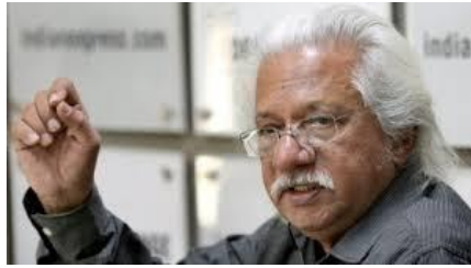
Adoor Gopalakrishnan (Internationally well-known film-maker)

“Bijaya Jena's ABHAAS is a quiet film; impressive in its persuasive charm, it is unhurried in pace and perceptive in treatment”