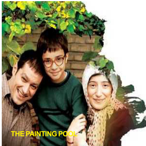
THE PAINTING POOL