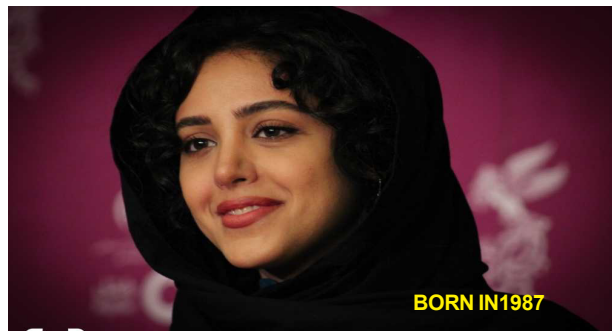
BORN IN 1987