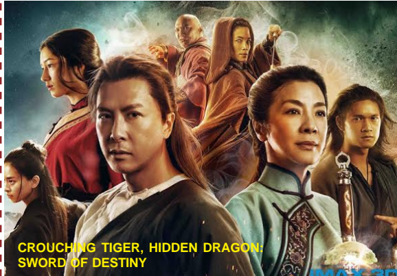
CROUCHING TIGER, HIDDEN DRAGON: SWORD OF DESTINY