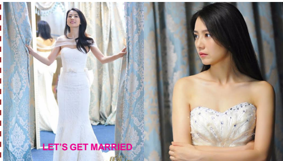
LET'S GET MARRIED