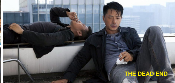
THE DEAD END