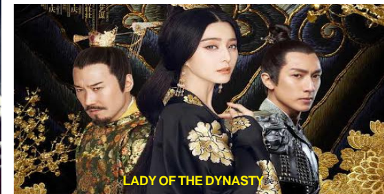
LADY OF THE DYNASTY