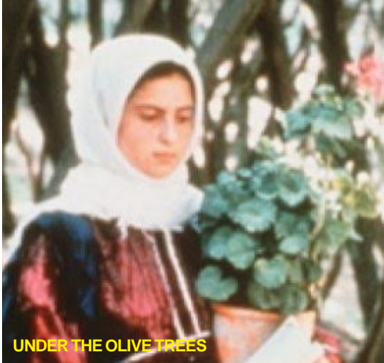
UNDER THE OLIVE TREES