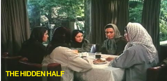
THE HIDDEN HALF