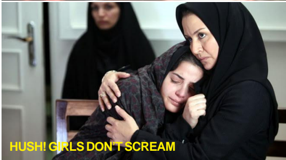
HUSH! GIRLS DON'T SCREAM