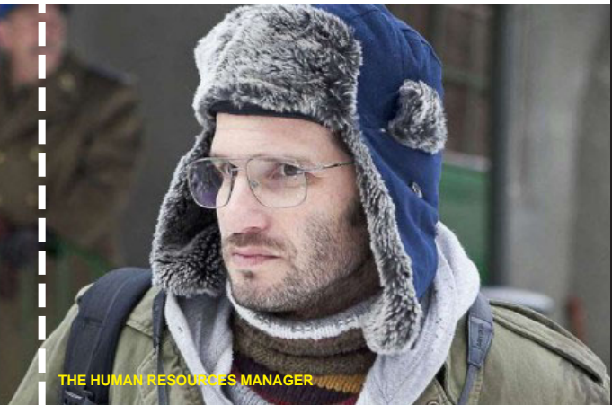
THE HUMAN RESOURCES MANAGER