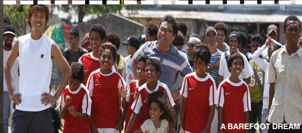
A BAREFOOT DREAM