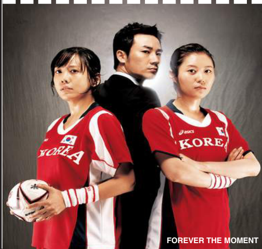
FOREVER THE MOMENT