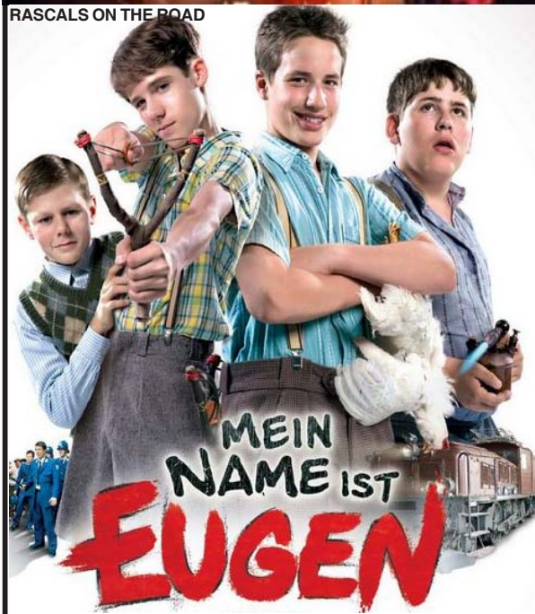
RASCALS ON THE ROAD