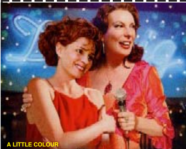
A LITTLE COLOUR