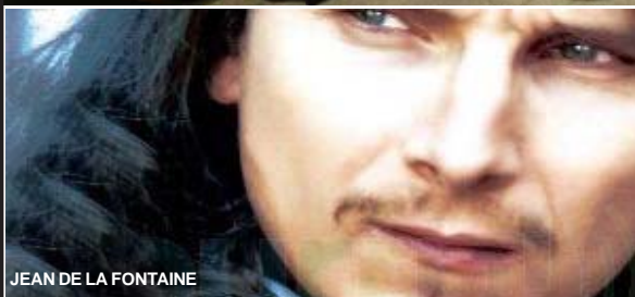
JEAN DE LA FONTAINE